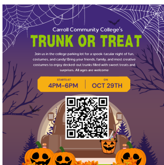
SGO Trunk or Treat